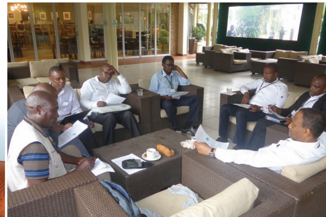
Botswana-South Africa Joint Strategic Action Plan (JSAP) discussions.

While there is no blueprint in terms of developing cooperation around TBAs, which our project cooperation and comparison also illustrated, it is clear that some generic lessons can be derived. It is anticipated that this Policy Brief will help inform and guide present and future activities and negotiations around transboundary aquifer cooperation for the water security and resilience of all countries in Southern Africa and beyond.