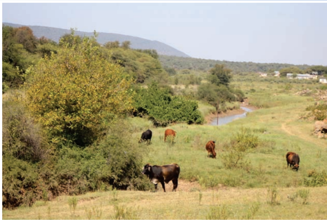
The Ramotswa Transboundary Aquifer Area. The Ngotwane River demarcates the border between Botswana (right) and South Africa (left).